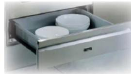
Storage / Warming Drawer